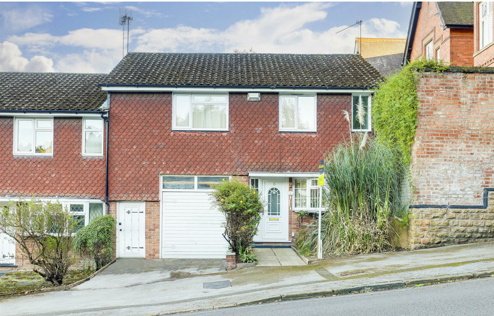
Cavendish Mews, The Park, Nottinghamshire NG7 IBY