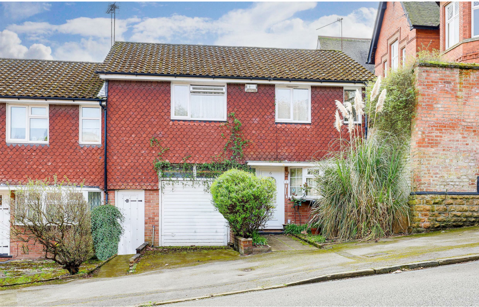
Cavendish Mews, The Park, Nottinghamshire NG7 IBY