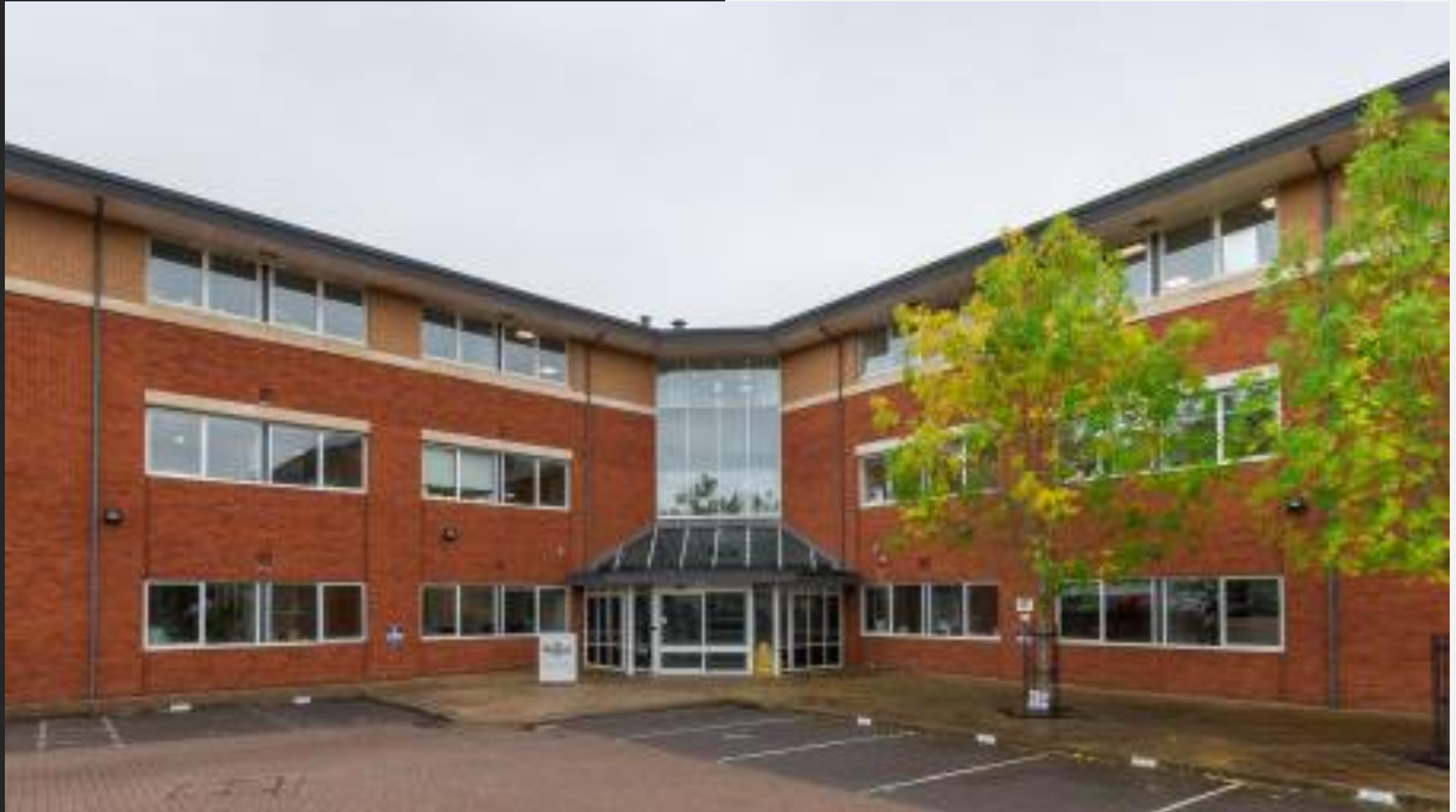
1 Emperor Way Exeter Business Park EX1 3QS