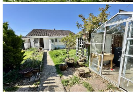
Want more photos and a video? Scan here