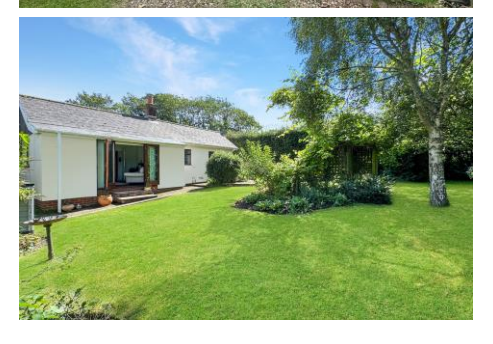
Want more photos and a video? Scan here