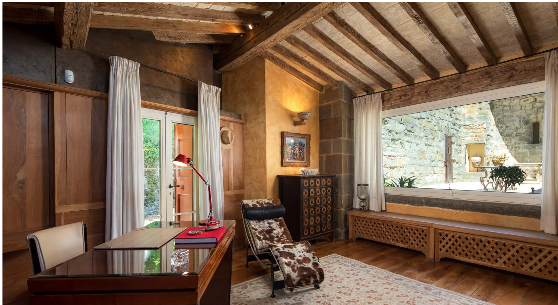
A SPACIOUS AND BRIGHT LIBRARY, A STUDY AND A CINEMA ROOM.