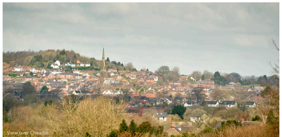
View over Cheadle