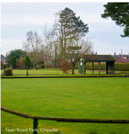
Tean Road Park, Cheadle

Built across a variety of styles to the high Bellway standard, these homes present a variety of design features including open-plan living spaces, contemporary fitted kitchens, bathrooms and en-suite bathrooms in addition to garages or allocated parking.