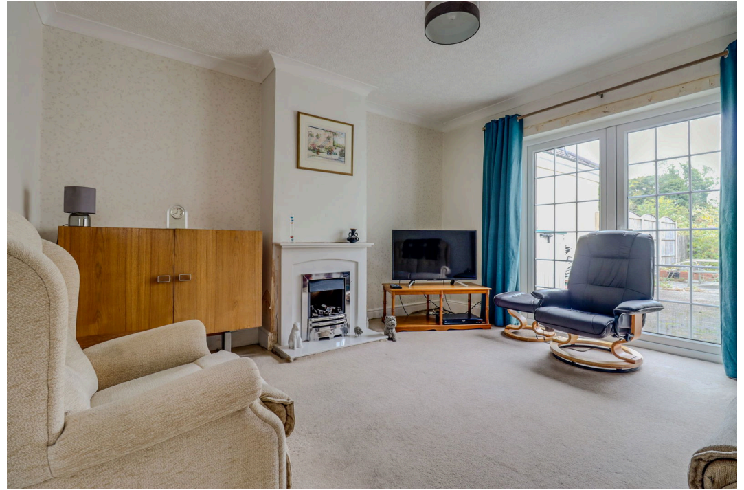
21 Charnwood Drive, Leicester Forest East