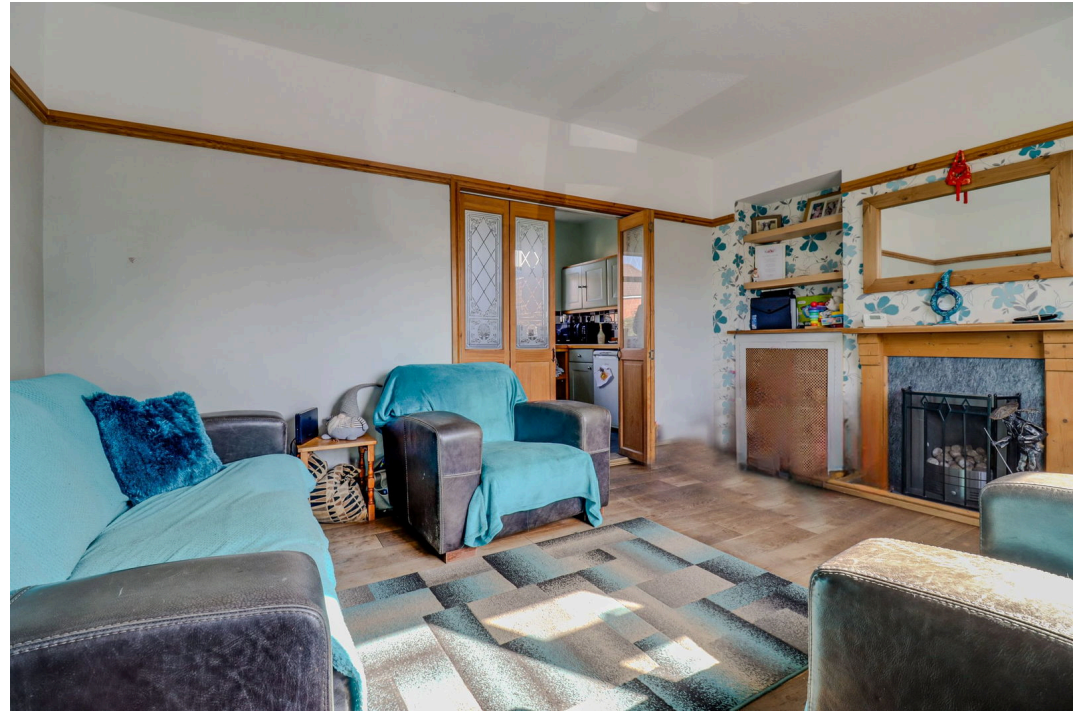
Markfield Road, Ratby