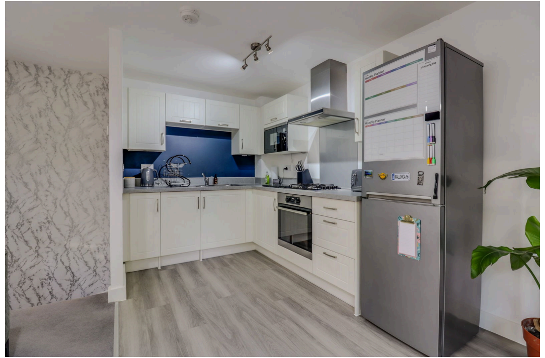
Rawlins Drive, Anstey