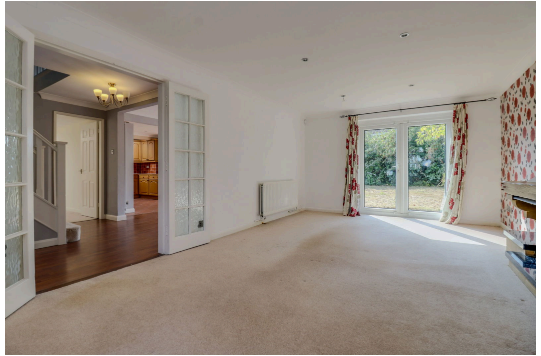
Kingfisher Close, Leicester Forest East