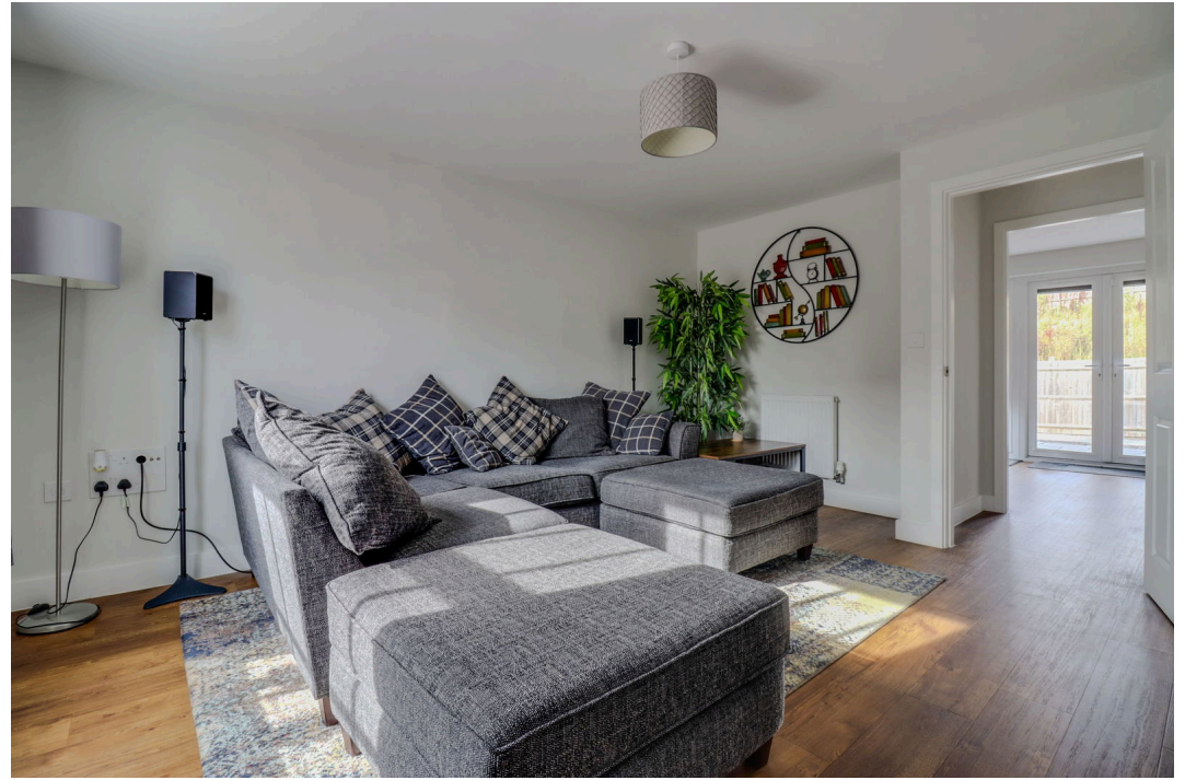
27 Rawlins Drive, Anstey