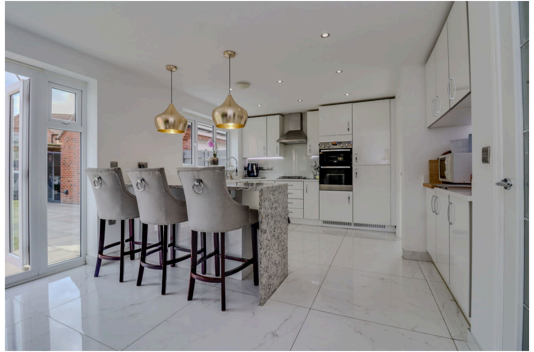
Kirkwood Close, Leicester Forest East