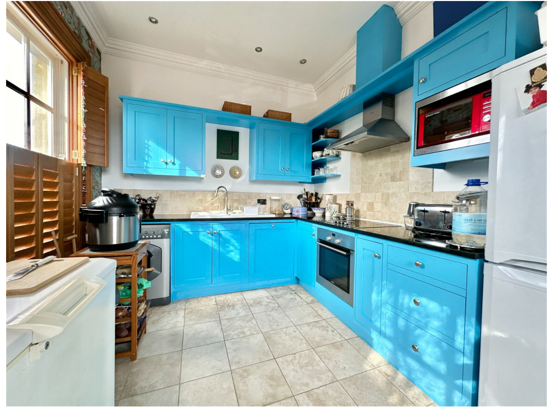
Goscote Hall, Edith Murphy Close, Birstall