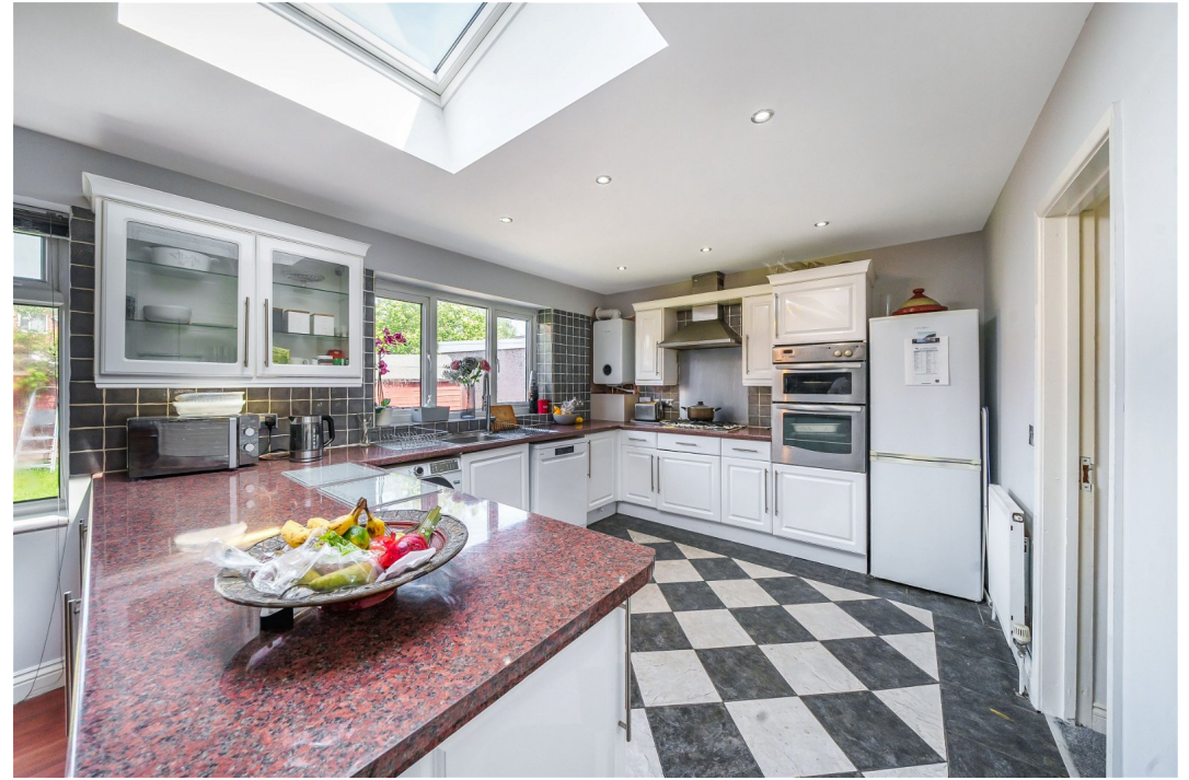
Welcombe Avenue, Braunstone Town