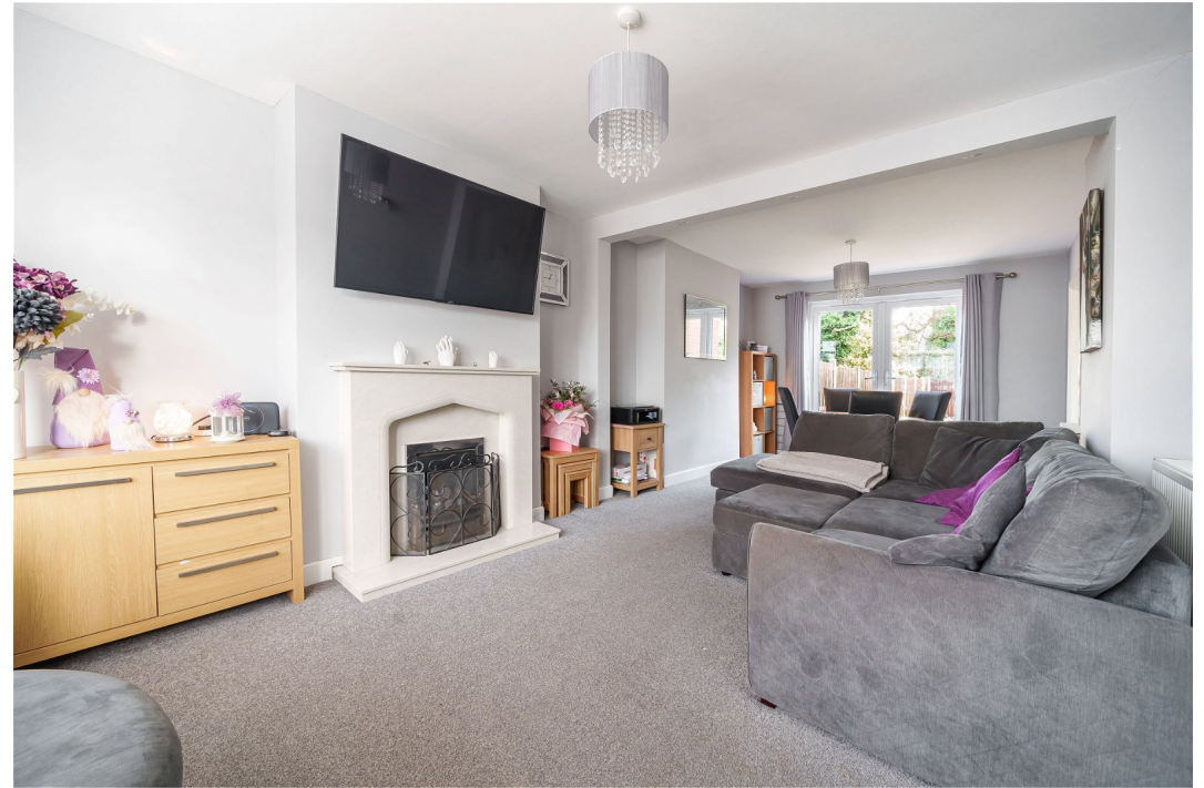
18 Grange Avenue, Leicester Forest East