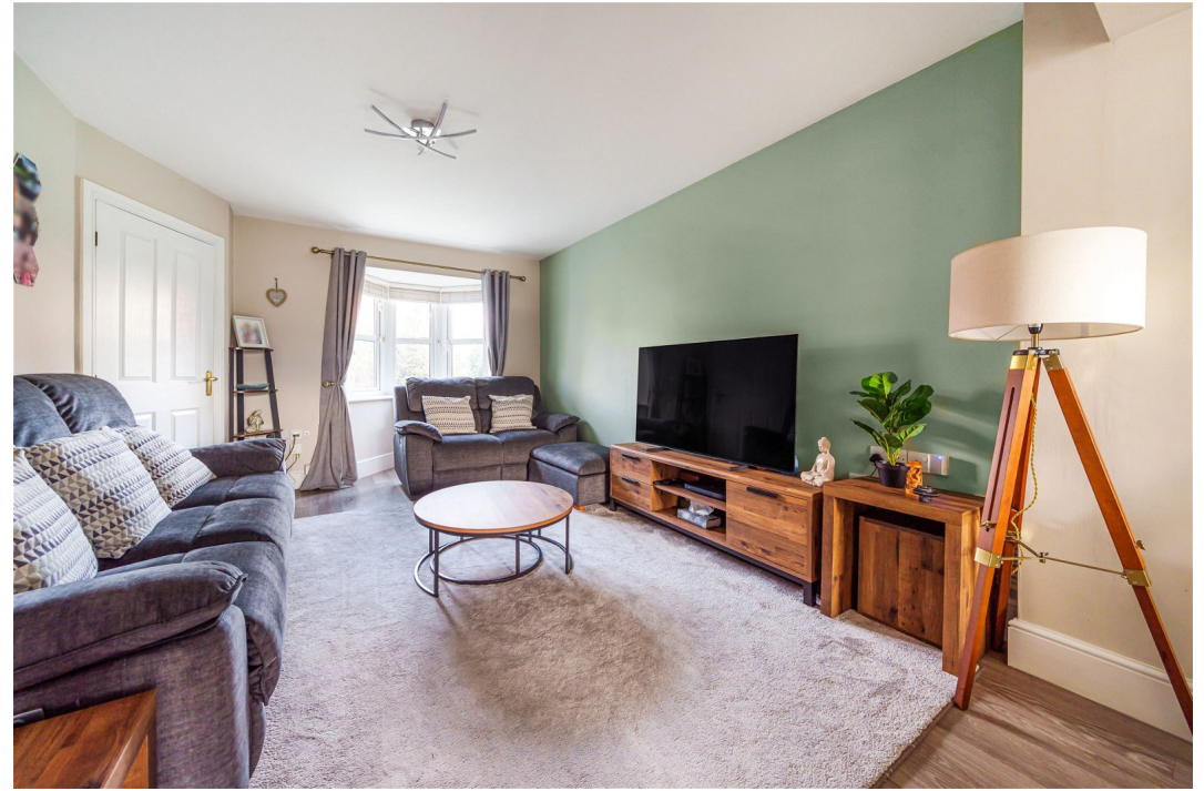
Shipman Road, Leicester