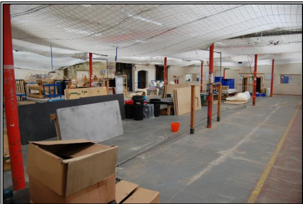
Area B Internal