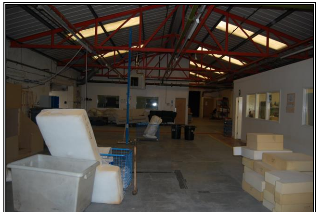
Area A Internal