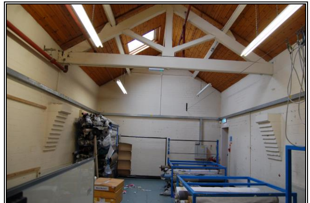
Area A Internal