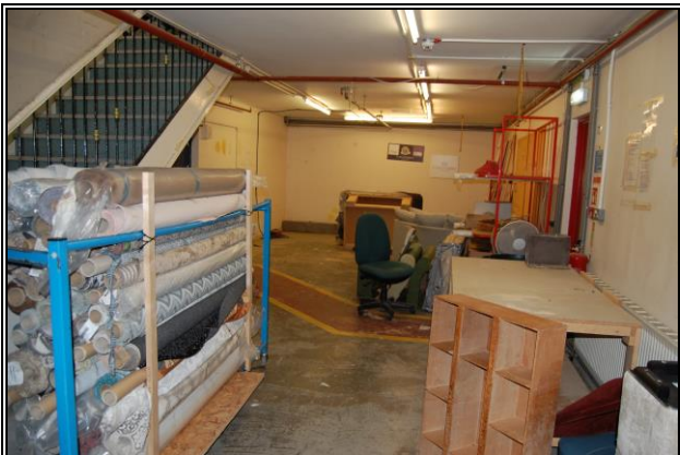
Area A Internal