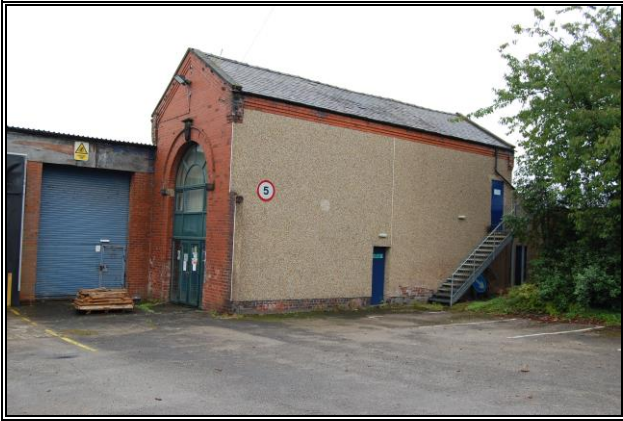
Area A Workshop