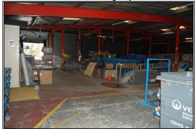
Area A Internal