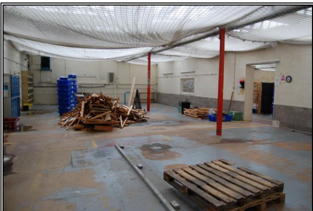
Area B Internal