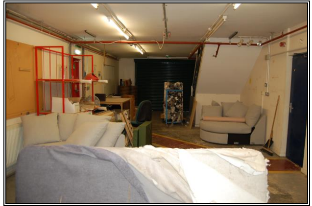
Area A Internal