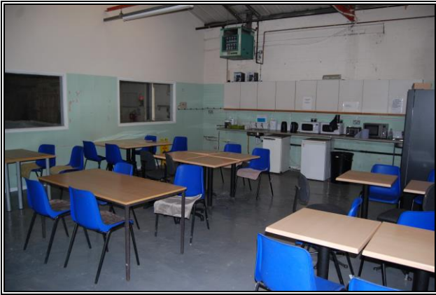
Area A Canteen