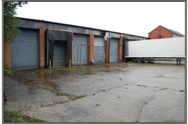
Area A Loading Bays