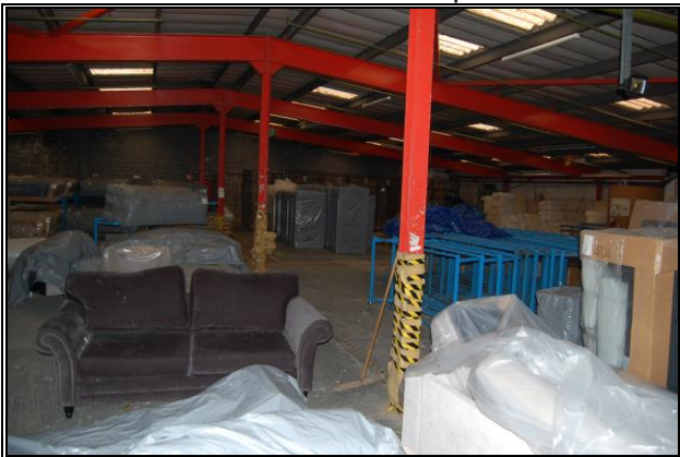
Area A Internal