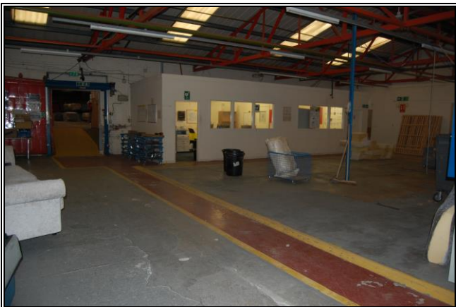
Area A Internal