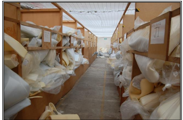
Area B Internal