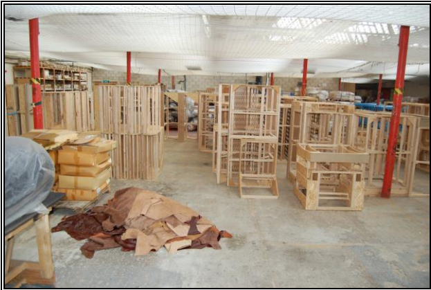
Area B Internal