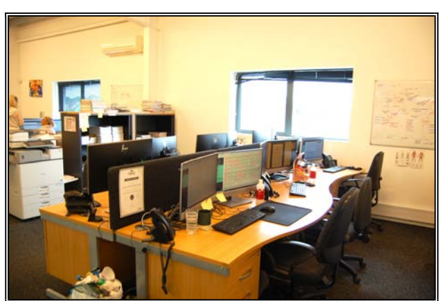
First Floor Open Plan Office