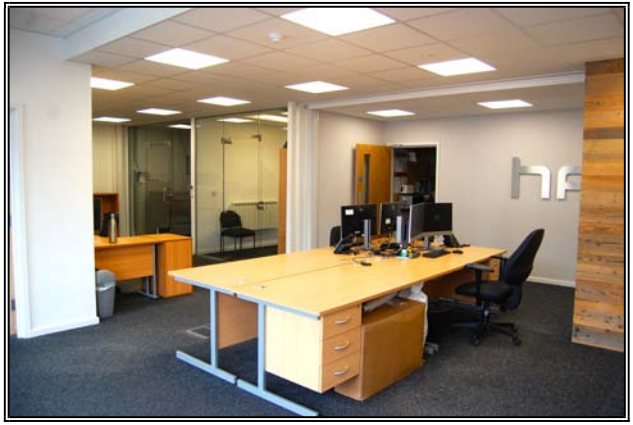
Ground Floor Office Front