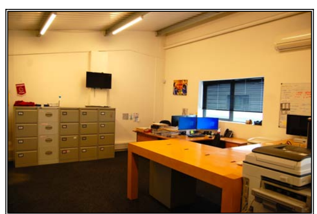
First Floor Open Plan Office