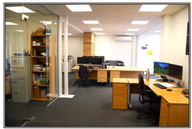
Ground Floor Office Rear