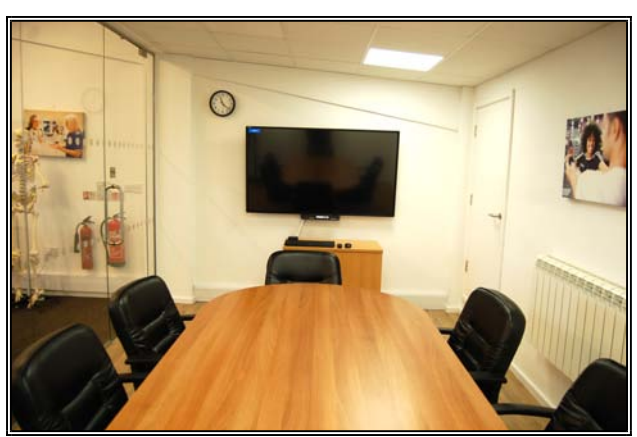
First Floor Boardroom

Units & & 8, Roundhouse Court, Barnes Wallis Way, Buckshaw Village, Chorley, PR7 7JN _{\rm 3}