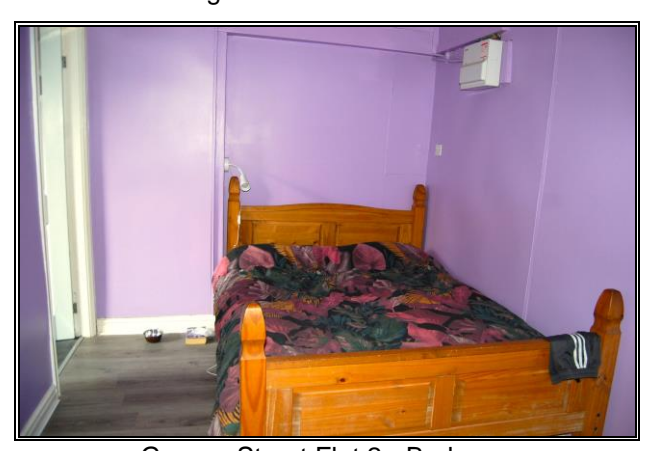
George Street Flat 2 - Bedroom