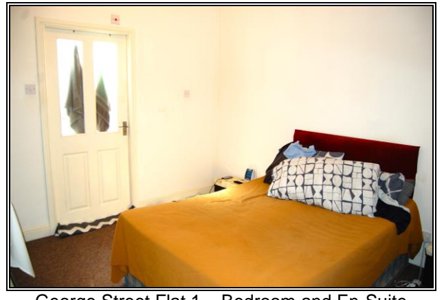
George Street Flat 1 - Bedroom and En-Suite