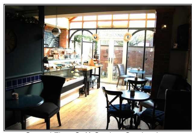
Ground Floor Café Outdoor Seating Area