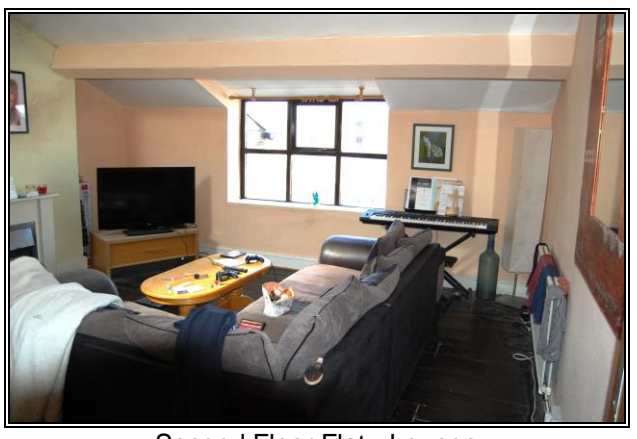
Second Floor Flat - Lounge