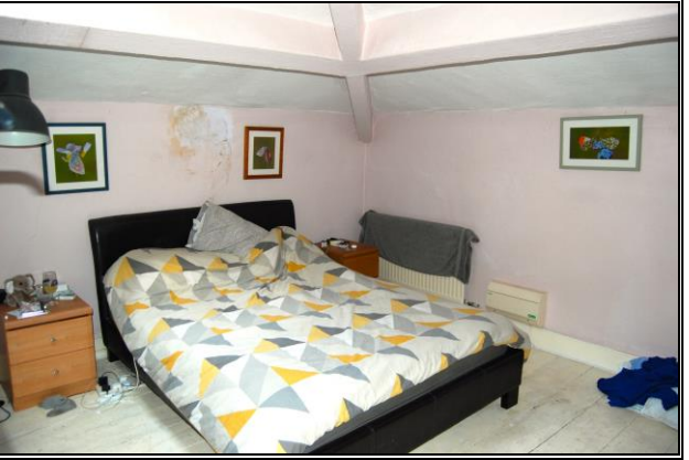
Second Floor Flat - Bedroom