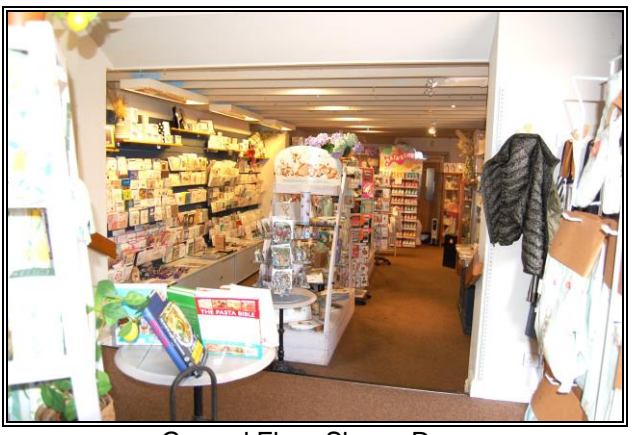
Ground Floor Shop - Rear