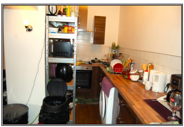
George Street Flat 1 - Kitchen