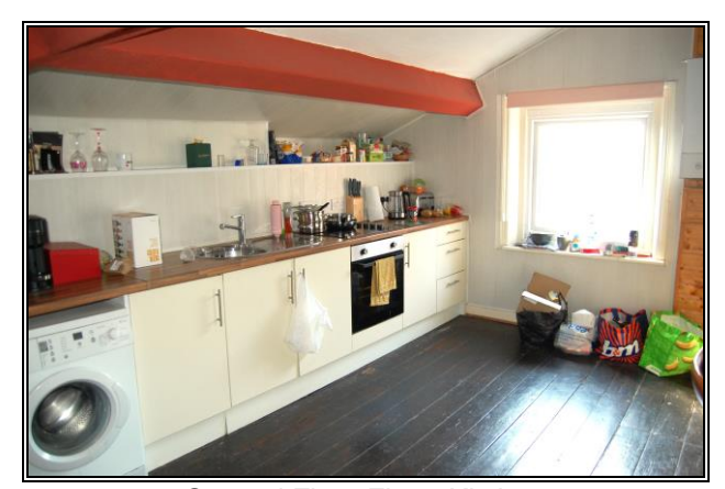
Second Floor Flat - Kitchen