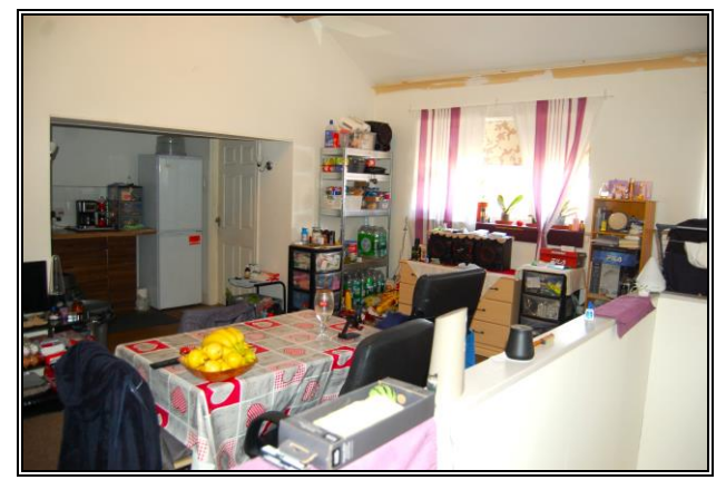
George Street Flat 1 - Lounge