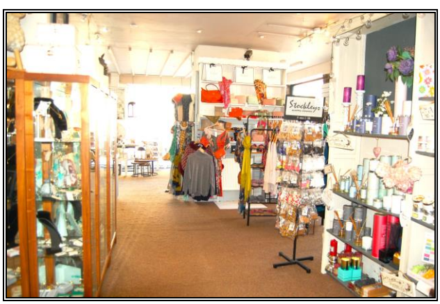
Ground Floor Shop - Middle