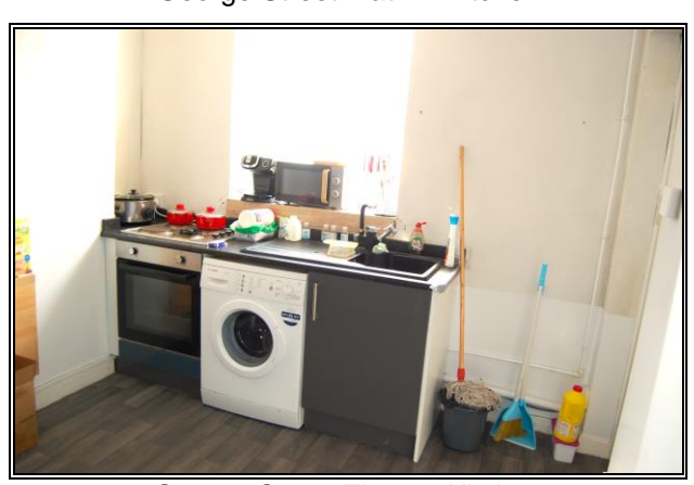
George Street Flat 2 - Kitchen