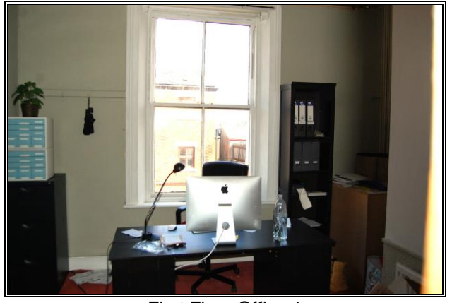
First Floor Office 1