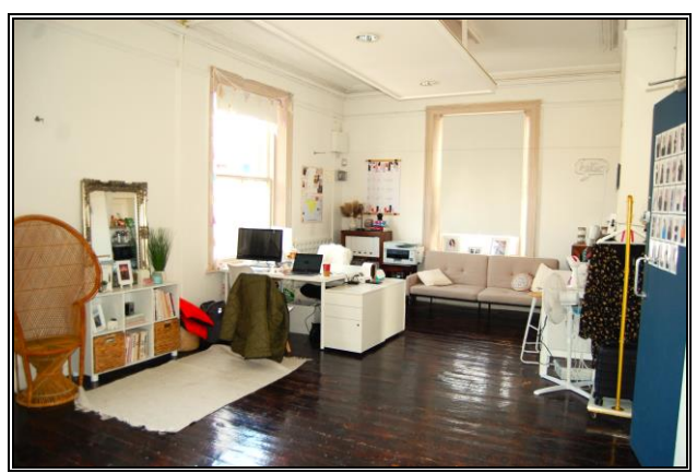
First floor Office 3