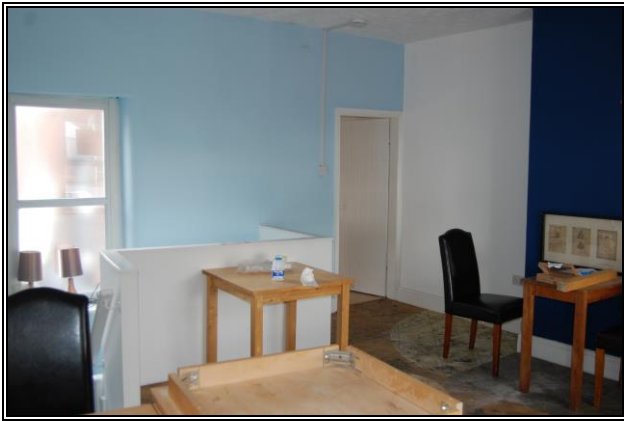
First Floor Rear