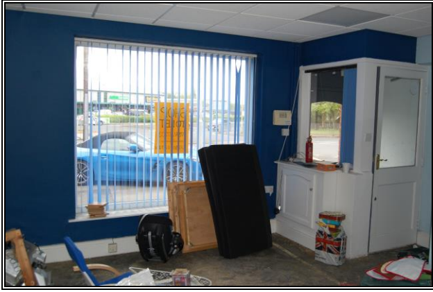
Ground Floor Front