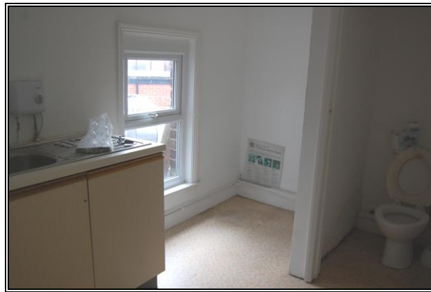
Kitchen & WC