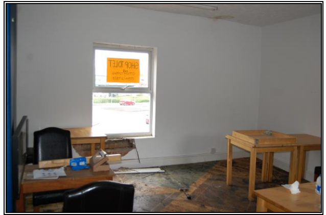
First Floor Front