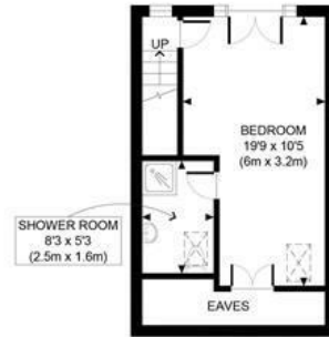
SECOND FLOOR GROSS INTERNAL FLOOR AREA 304 SQ FT