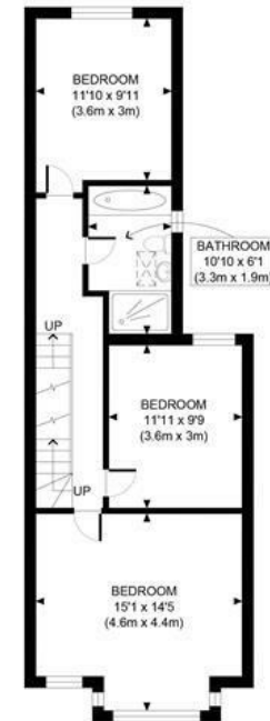
FIRST FLOOR GROSS INTERNAL FLOOR AREA 622 SQ FT

APPROX. GROSS INTERNAL FLOOR AREA WITH EAVES 1832 SQ FT / 170 SQM APPROX. GROSS INTERNAL FLOOR AREA WITHOUT EAVES 1788 SQ FT / 166 SQM Ref: Copyright photoplan Disclaimer: Floor plan measurements are approximate and are for illustrative purposes only. While we do not doubt the floor plan accuracy and completeness, you or your advisors should conduct a careful, independent investigation of the property in respect of monetary valuation