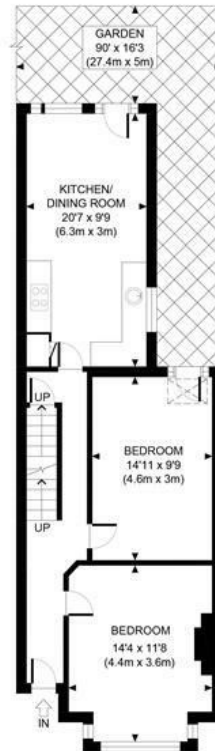
GROUND FLOOR GROSS INTERNAL FLOOR AREA 630 SQ FT