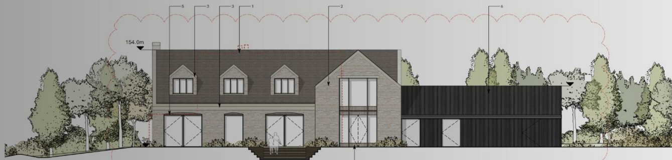
1 WEST ELEVATION (REAR) Scale: 1:100