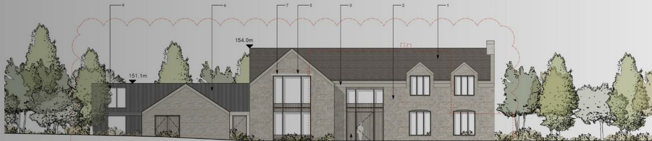
2 EAST ELEVATION (FRONT) Scale: 1:100