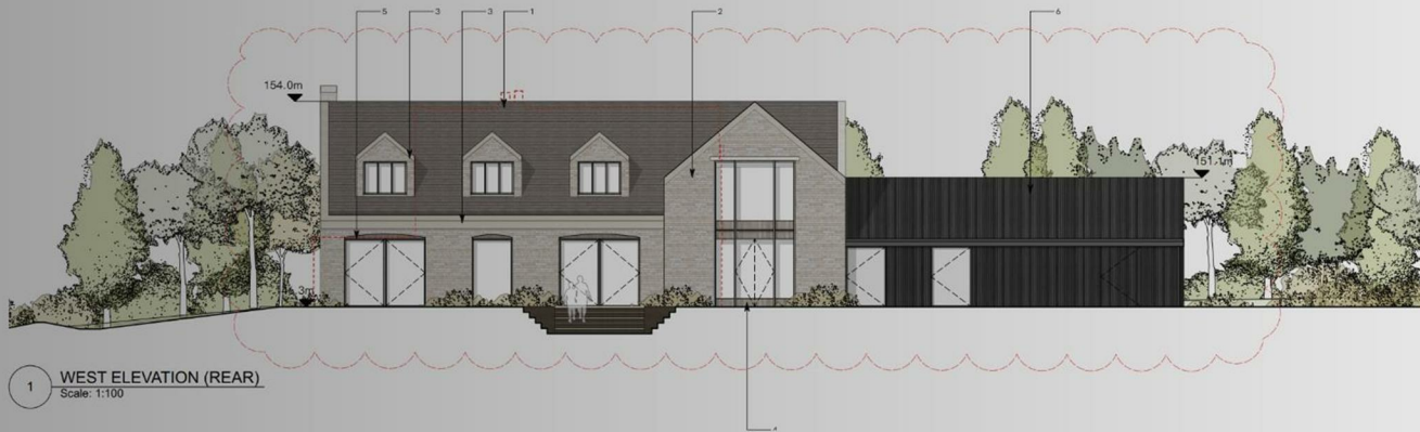
1 WEST ELEVATION (REAR) Scale: 1:100