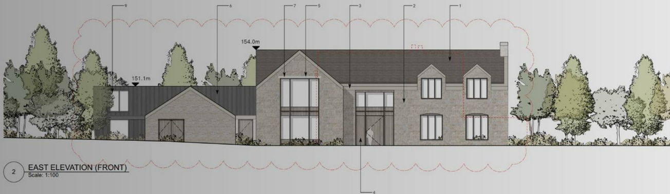
2 EAST ELEVATION (FRONT) Scale: 1:100