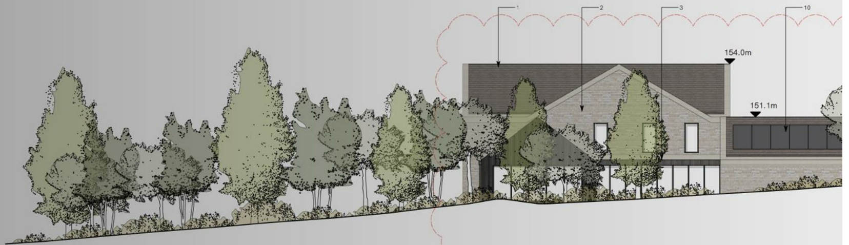
2 NORTH ELEVATION Scale: 1:100