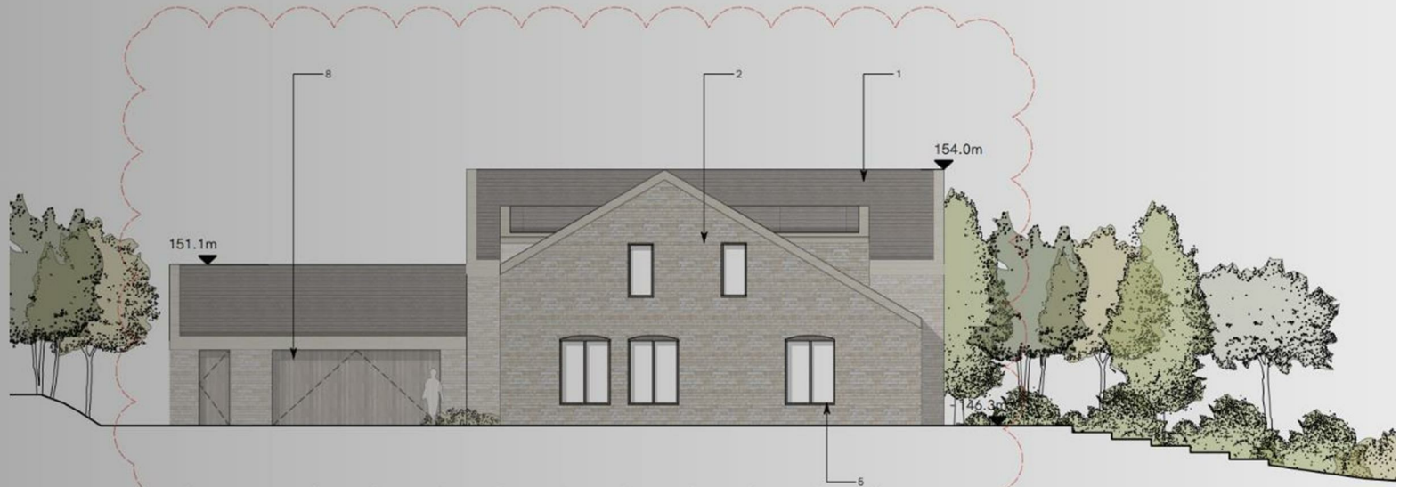
1 NORTH ELEVATION Scale: 1:100