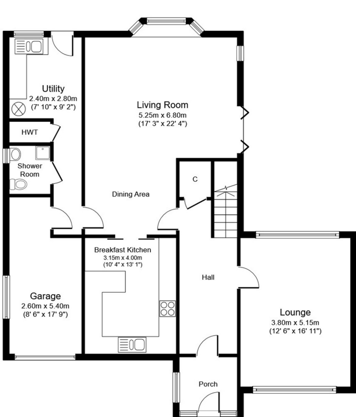
Ground Floor Approximate Floor Area 1,166 sq. ft. (108.3 sq. m.)