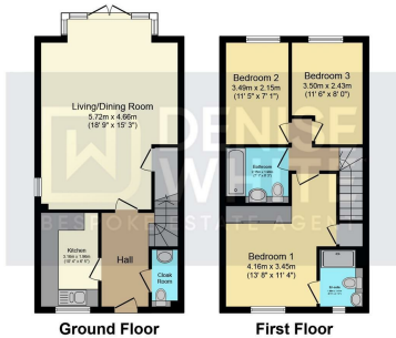
Total floor area 86.9 m² (936 sq.ft.) approx This plan is for illustration purposes only and may not be representative of the property. Plan not to scale. Powered by PropertyFox