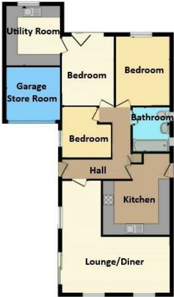
Total floor area 97.9 sq.m. (1,054 sq.ft.) approx

This floorplan is for illustrative purposes only and is not drawn to scale. Measurements, floor-areas, openings and orientations are approximate. They should not be relied upon for purpose and do not form any part of an agreement. No liability is taken for any error or mis-statement. All parties must rely on their own inspections.