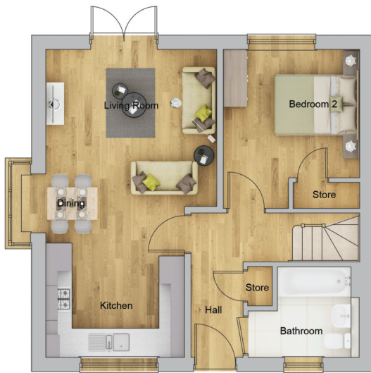
Kitchen/living/dining 3.15/3.90m x 7.04m 10'3"/12'8" x 24'0"