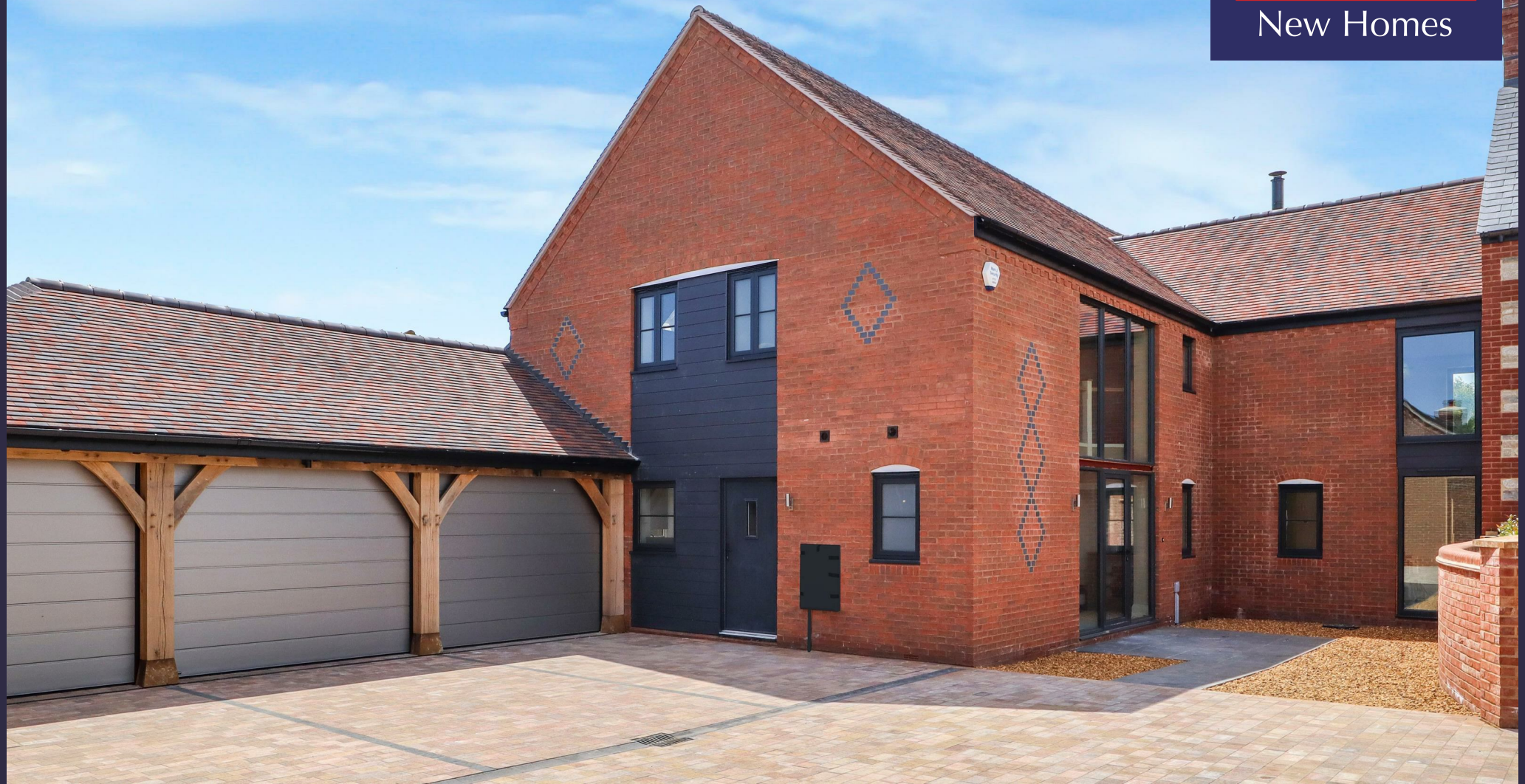
The Granary, Manor Farm Court, Kineton Road, Gaydon, Warwick, CV35 0HB