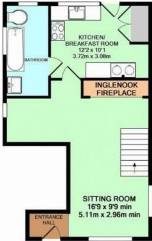
GROUND FLOOR APPROX. FLOOR AREA 412 SQ.FT. (38.3 SQ.M.)

FLOORPLAN: Dimensions are maximum unless stated – subject to copyright this plan is intended as a guide to layout only and must not be relied upon for any other purpose.