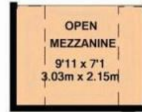
STORAGE AREA APPROX. FLOOR AREA 74 SQ.FT. (6.8 SQ.M.)