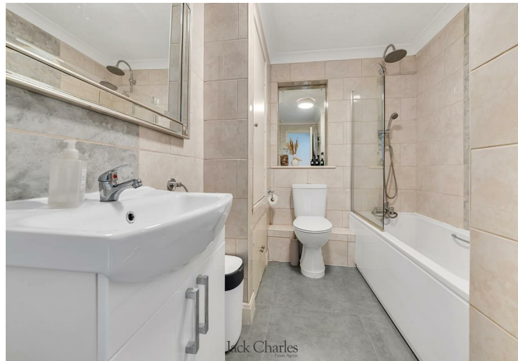
Jack Charles Estate Agents