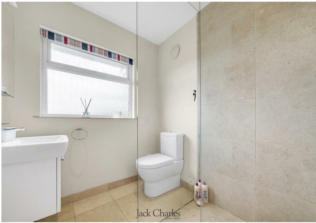
Jack Charles Estate Agents