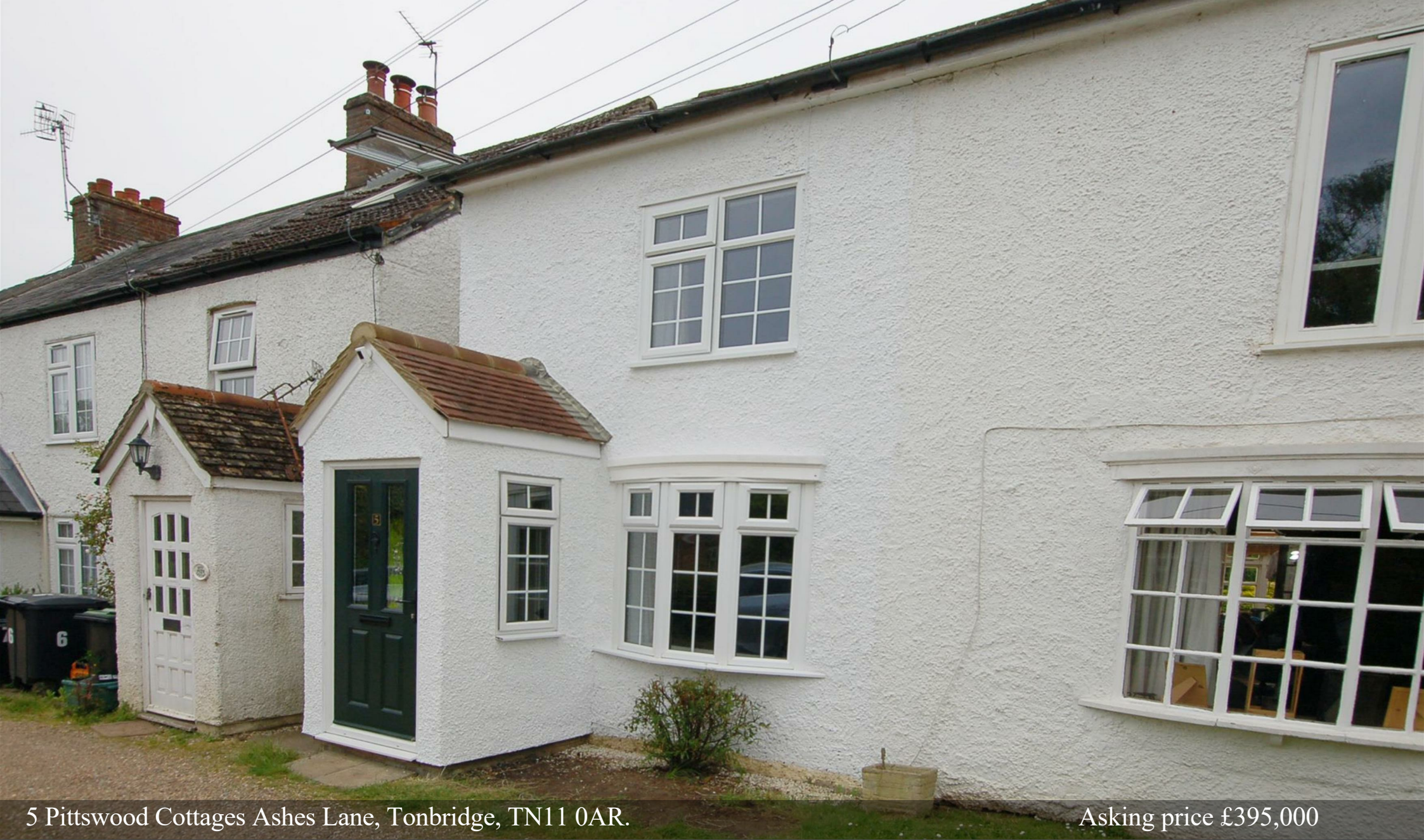
5 Pittswood Cottages Ashes Lane, Tonbridge, TN11 0AR.