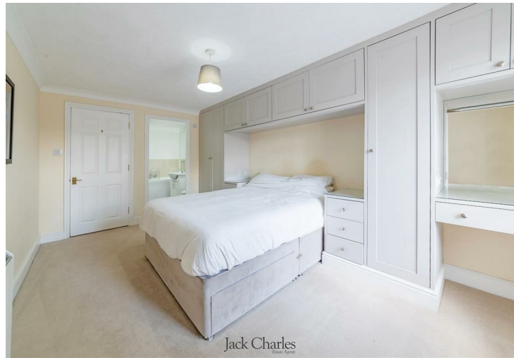
Jack Charles Estate Agents