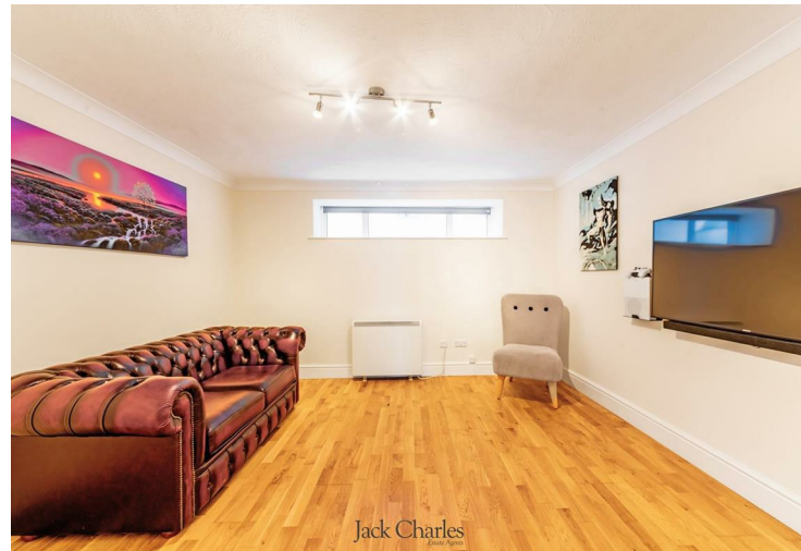
Jack Charles Estate Agents