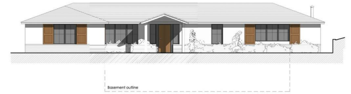
Proposed Front Elevation 1:100