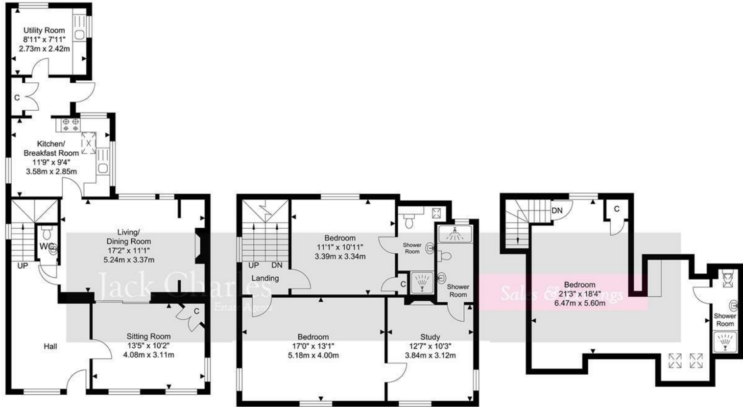
Ground Floor Approximate Floor Area 742.60 SQ.FT. (68.99 SQ.M.)