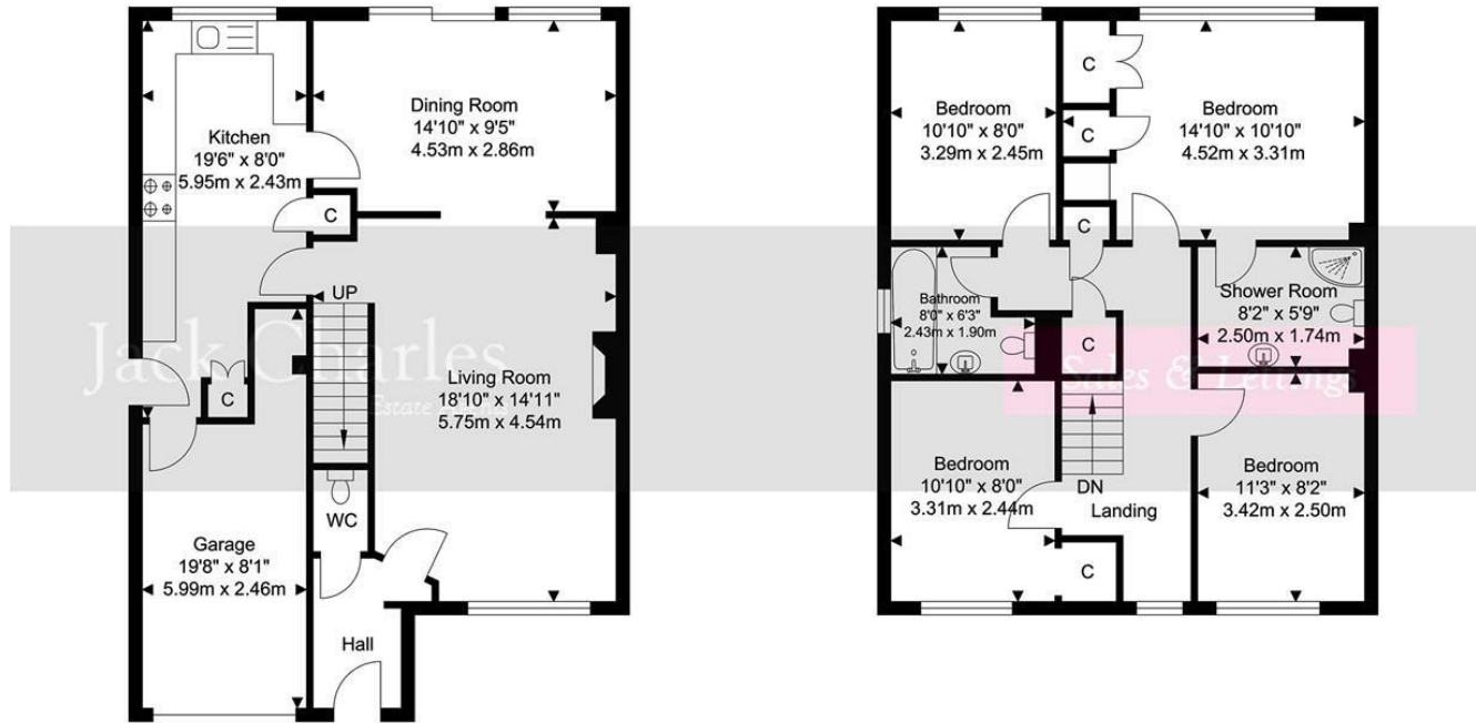
Ground Floor Approximate Floor Area 732.48 SQ.FT. (68.05 SQ.M.)

FLOORPLAN: Dimensions are maximum unless stated – subject to copyright this plan is intended as a guide to layout only and must not be relied upon for any other purpose.