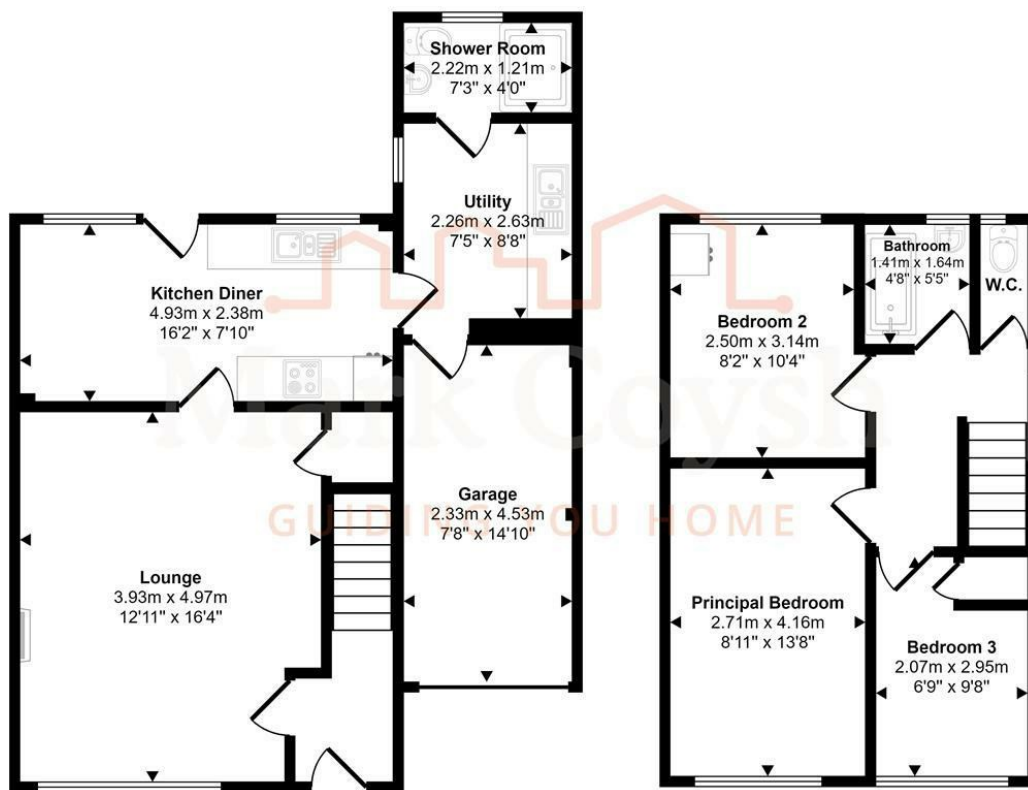
Ground Floor Approx 58 sq m / 628 sq ft

Approx Gross Internal Area 95 sq m / 1019 sq ft