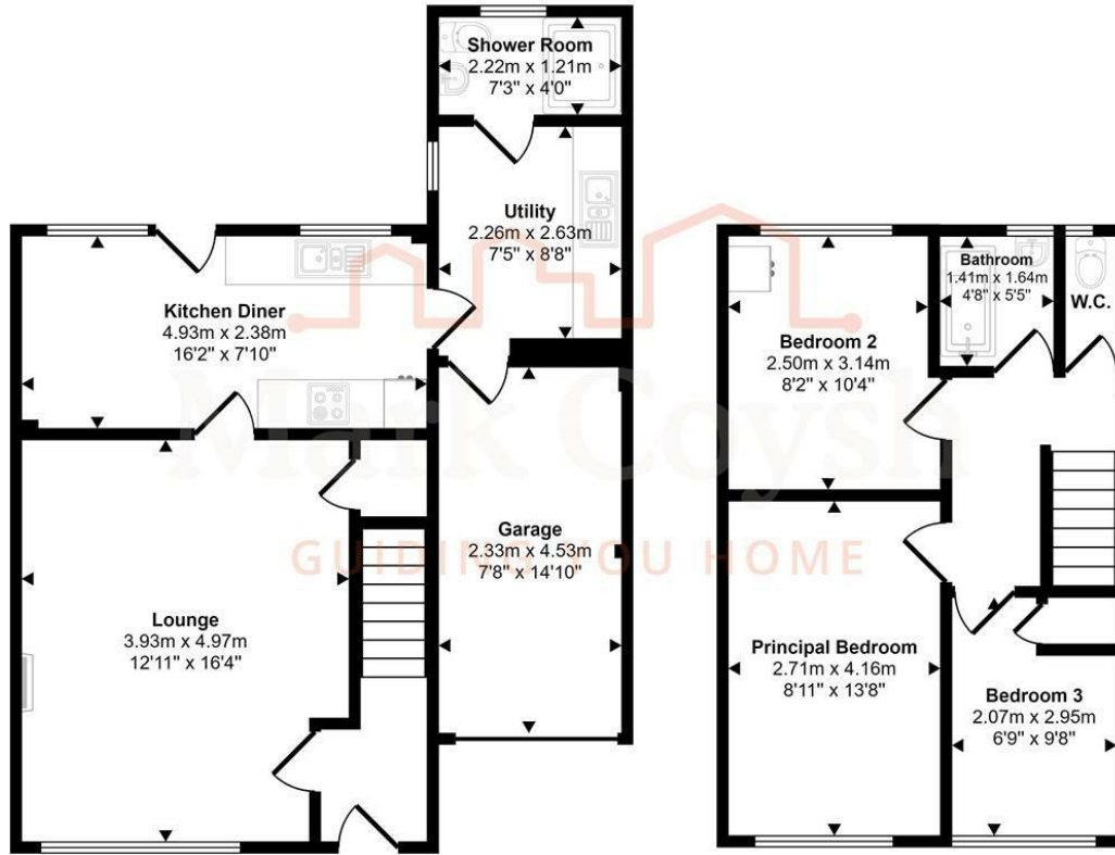
Ground Floor Approx 58 sq m / 628 sq ft

Approx Gross Internal Area 95 sq m / 1019 sq ft