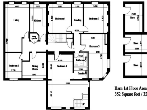
Barn 1st Floor Area 352 Square feet / 32.7 m 2

1st Floor Area: 2000 square feet / 186 m 2