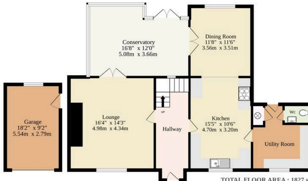
Ground Floor 1110 sq.ft. (103.1 sq.m.) approx.