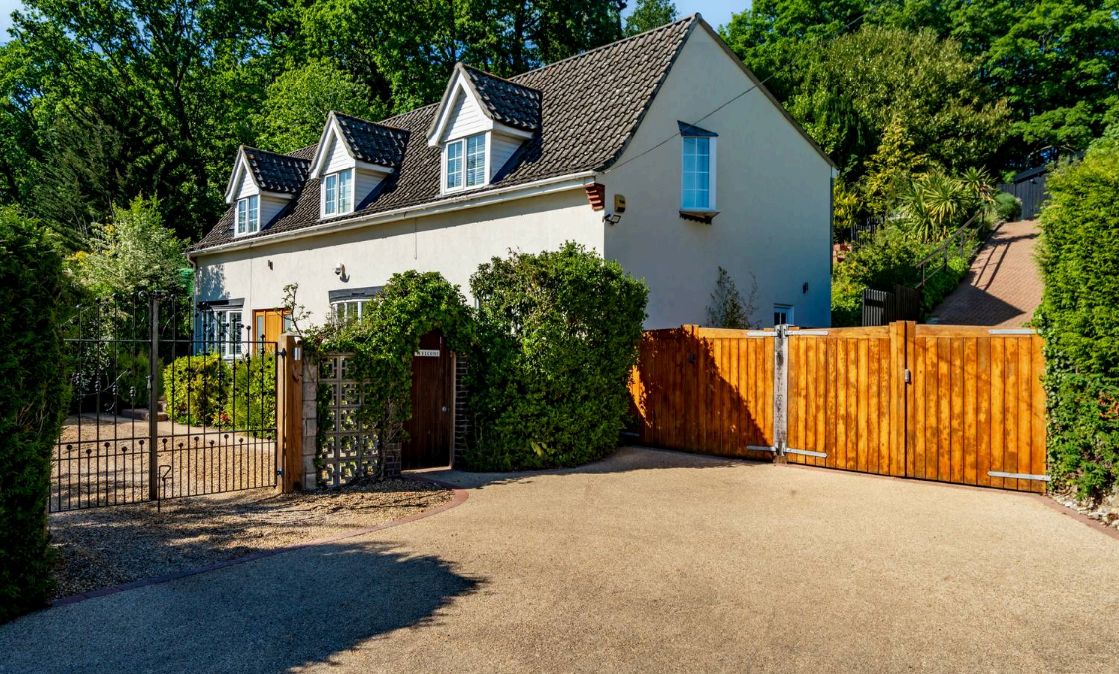
Pound Cottage Townhouse Road, Costessey £875,000