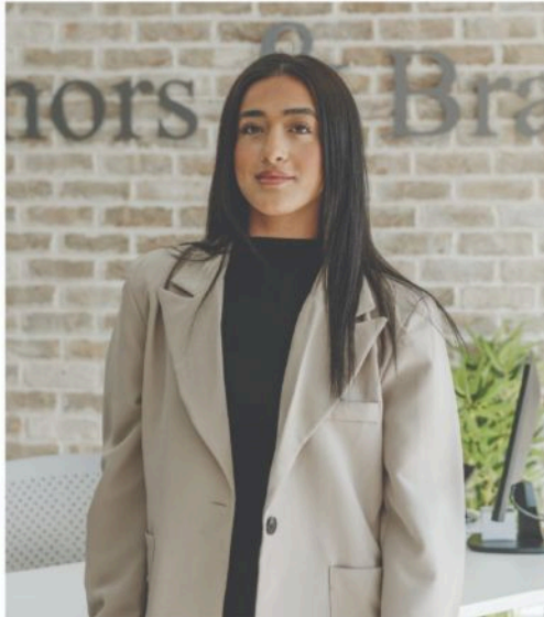
Meet Ayesgul Aftersales Progressor