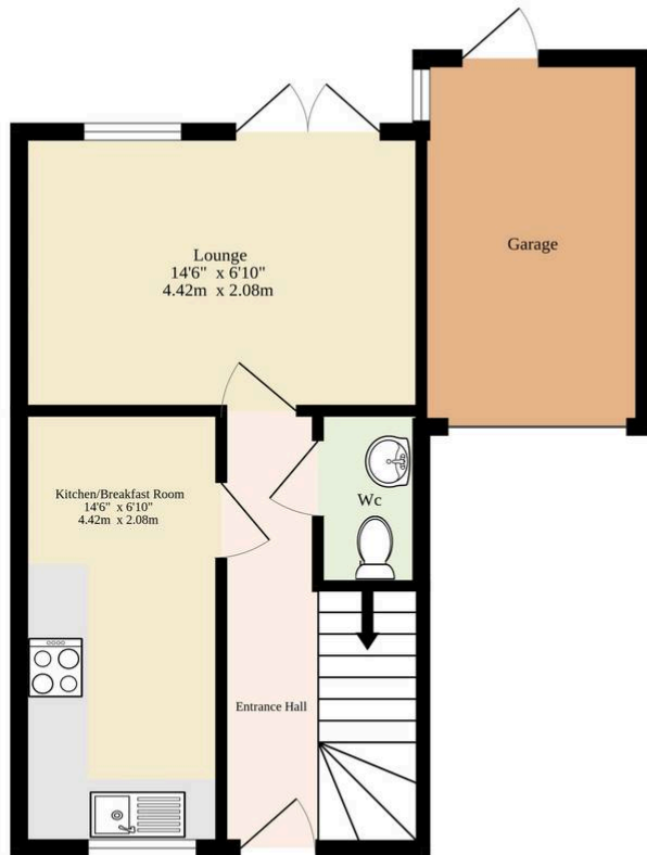
Ground Floor 235 sq.ft. (21.8 sq.m.) approx.