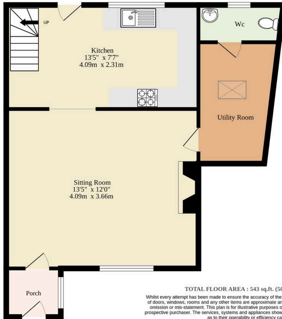
Ground Floor 327 sq.ft. (30.4 sq.m.) approx.