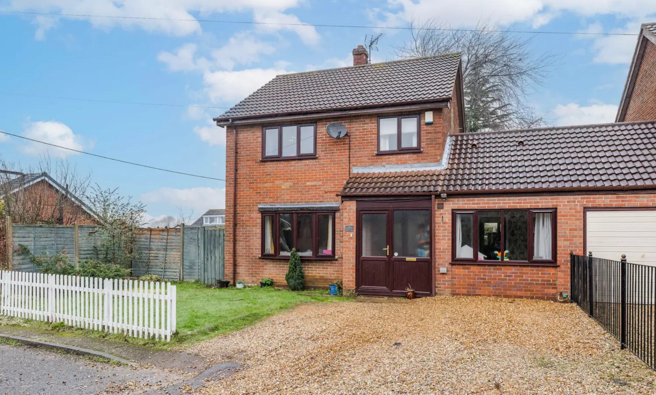
1 Keys Farm, Mattishall £320,000