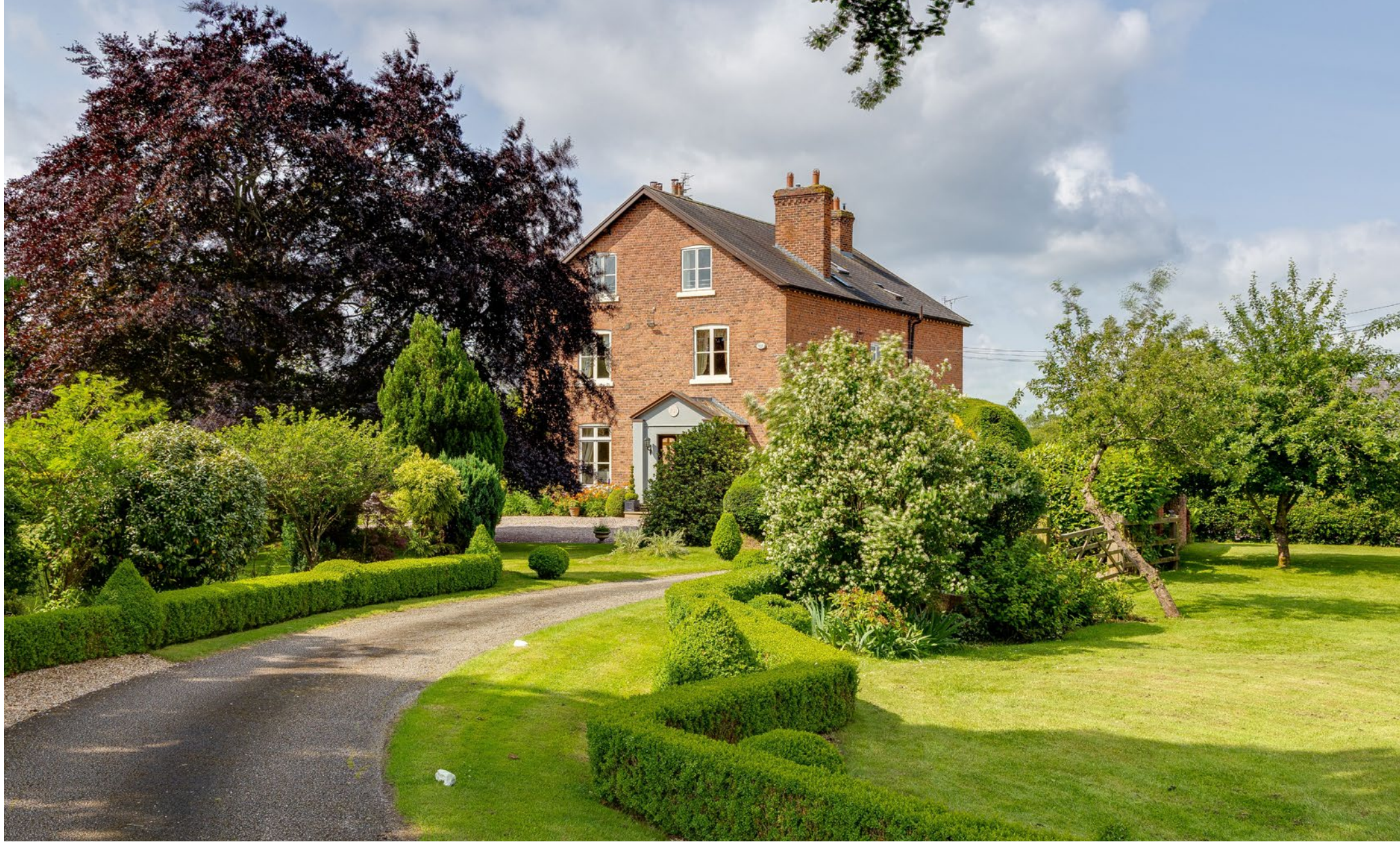
Golborne Manor HATTON HEATH, CHESTER