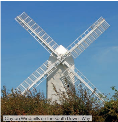
Clayton Windmills on the South Downs Way

together with a close proximity to the village's amenities. The selection of well-regarded local schools will appeal to families, whilst the excellent choice of travel links will be of benefit to commuters, with Brighton just a 15-minute drive away and central London reachable in an hour by train. There is something for everyone at Kingsland Gate.