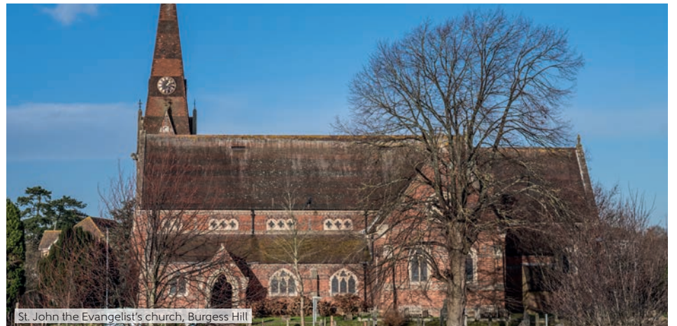
St. John the Evangelist's church, Burgess Hill