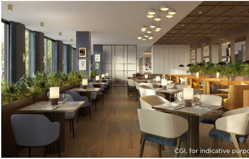
CGI, for indicative purposes